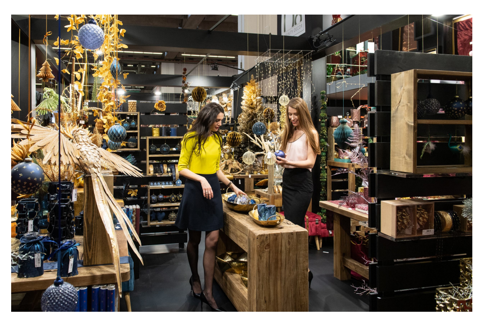
The latest trends in festive decoration intensify and boost the shopping experience.

Astonishing and inspiring! Christmasworld supplies the international decoration trade with new products and eye-catchers for the busiest and most emotional time of the year. Like no other trade fair for the consumer-goods sector, Christmasworld focuses on the point-of-sale experience as a factor for success. Once again, it will be the indispensable business and order platform for the trade from 24 to 28 January 2020. Around 1,000 exhibitors are expected to take part in the world's leading trade fair for seasonal and festive decorations.