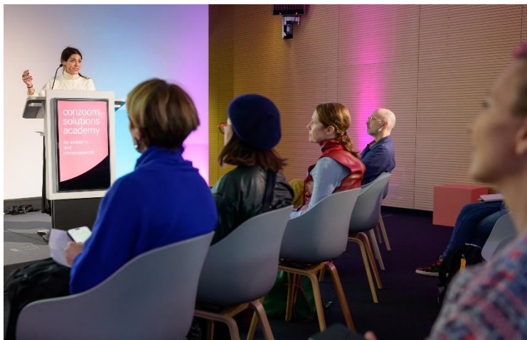
The experts at the Conzoom Solutions Academy in room Europa, Hall 4.0, provide fresh business impetus.

Frankfurt am Main, November 2024. The challenges in the market are increasing, geopolitical tensions are intensifying and insolvencies are changing the retail landscape. At the same time, new opportunities are emerging via artificial intelligence or circular design approaches. This requires new business impetus and the courage to break new ground. At the Conzoom Solutions Academy, renowned experts bring their knowledge to the stage and initiate new ideas. Trends and tips for sales-boosting and sustainable product ranges as well as more experience factor at the point of sale are also on the agenda.