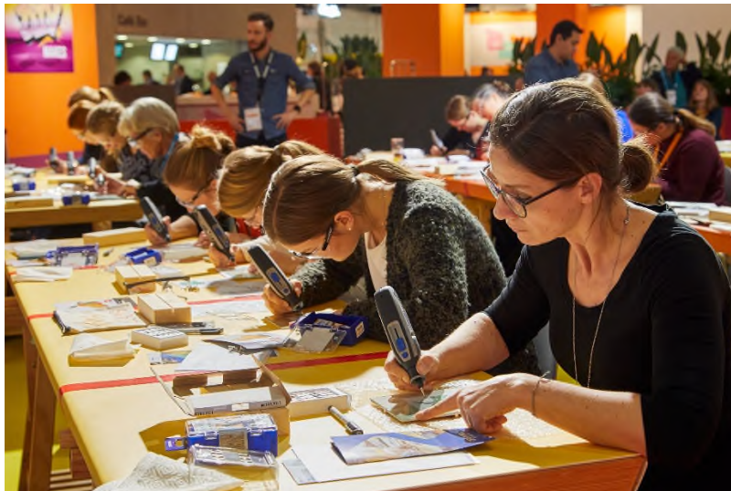
Test the latest products live on site, at the Creative Academy.